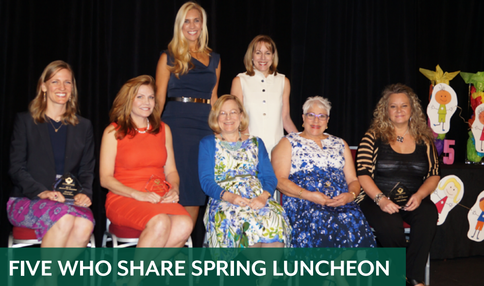
FIVE WHO SHARE SPRING LUNCHEON

*In collaboration with Junior League of The Woodlands