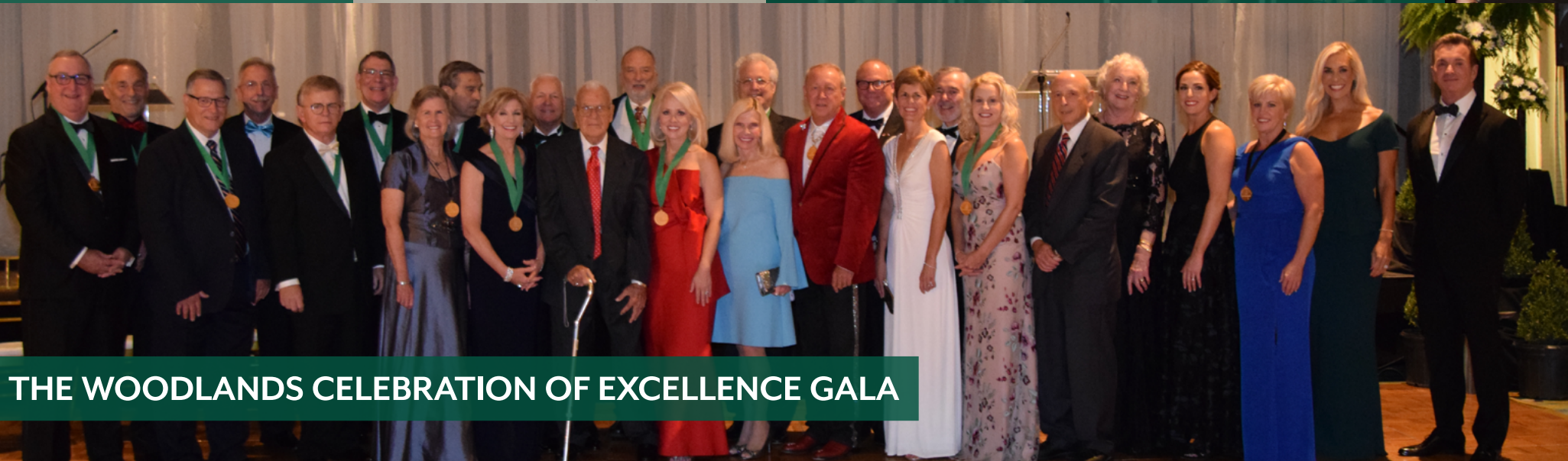
THE WOODLANDS CELEBRATION OF EXCELLENCE GALA